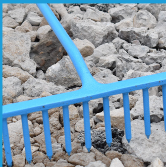
CARBON STEEL CONSTRUCTION