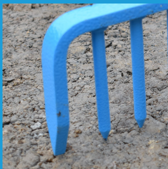
17-INCH STURDY PRONGS