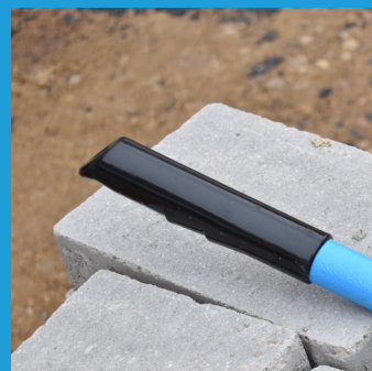
ERGONOMIC COMFORT GRIP