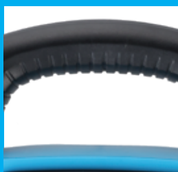
RUBBER OVERMOLD GRIP FOR INCREASED COMFORT

INTRODUCING THE OX PRO SERIES GIANT CHALK REEL, THE ULTIMATE TOOL FOR HEAVY-DUTY, LARGE-SCALE CONSTRUCTION PROJECTS. WITH ITS EXTRA-LARGE DESIGN AND FULL-HAND GRIP HANDLE, THIS REEL PROVIDES THE COMFORT, CONTROL, AND EASE OF USE CONTRACTORS NEED. EQUIPPED WITH A 4:1 PLANETARY GEAR RATIO, THIS REEL DELIVERS FAST, EFFICIENT REELING, REDUCING DOWNTIME AND KEEPING YOUR WORKFLOW SMOOTH. THE INTEGRATED LOOP STORAGE KEEPS THE TOOL ORGANISED AND READY FOR QUICK ACCESS, WHILE THE STEEL CRANK ADDS TO ITS DURABILITY, GUARANTEEING RELIABLE PERFORMANCE EVEN UNDER HEAVY USE. STAND ON ITS SIDE FOR HANDS-FREE REFILLS, MAKING IT EASIER TO MANAGE AND REFILL WITHOUT INTERRUPTING YOUR WORK. FROM COMMERCIAL CONSTRUCTION SITES TO ROOFING, FRAMING, MASONRY, AND CONCRETE APPLICATIONS, THE OX PRO GIANT CHALK REEL IS ENGINEERED TO HANDLE THE MOST DEMANDING JOBS WITH EASE AND PRECISION.