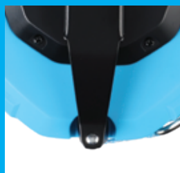
STEEL CRANK FOR DURABILITY